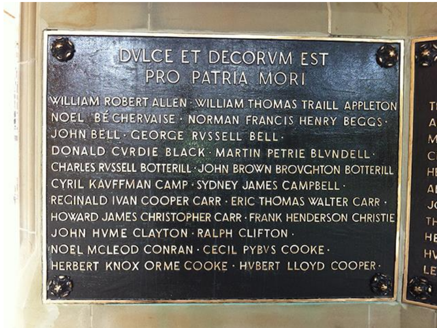
Geelong Grammar School