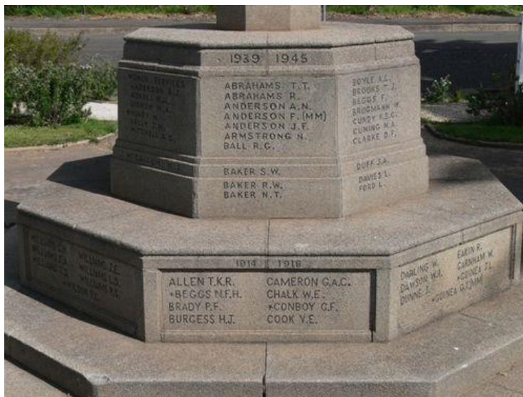
Glenthompson War Memorial