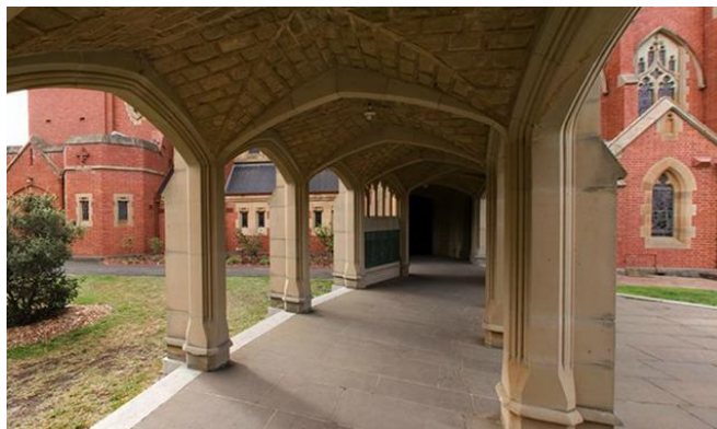
The Cloisters – Geelong Grammar School (Corio Campus)